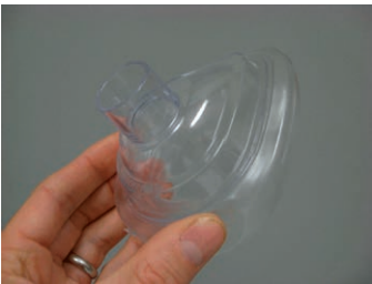
A face mask

If the anaesthetic is started with gas, the anaesthetist generally uses a mask to give the gas, or he/she may pass the gas through a cupped hand gently placed over your child's nose and mouth. Anaesthetic gases smell similar to felt-tip pens. It normally takes a little while (one to two minutes) for the anaesthetic to take effect. It is normal for the child to become restless during this time. Staff will help you hold your child gently but firmly.